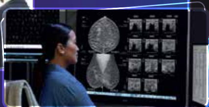
TOMO READING WORKSHOP WITH AI