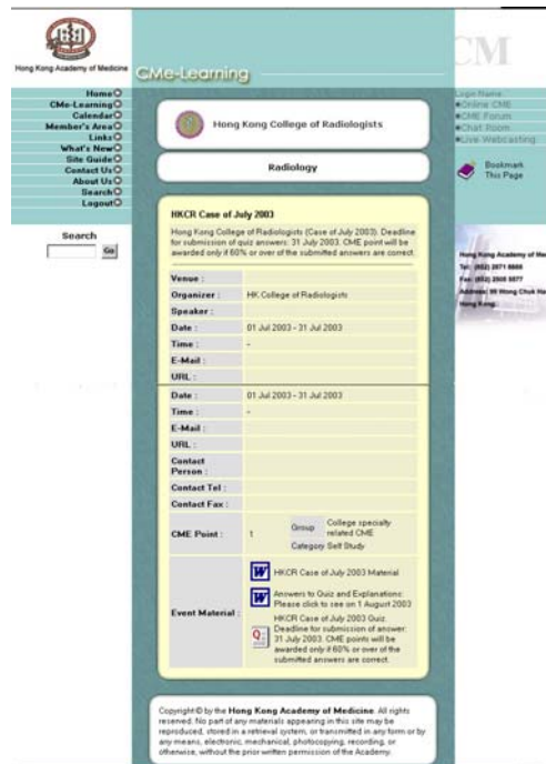
The Final Page where you can view the Case of the Month and get CME