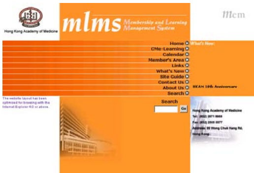
The MLMS Main Page at http://www.mlms.org.hk