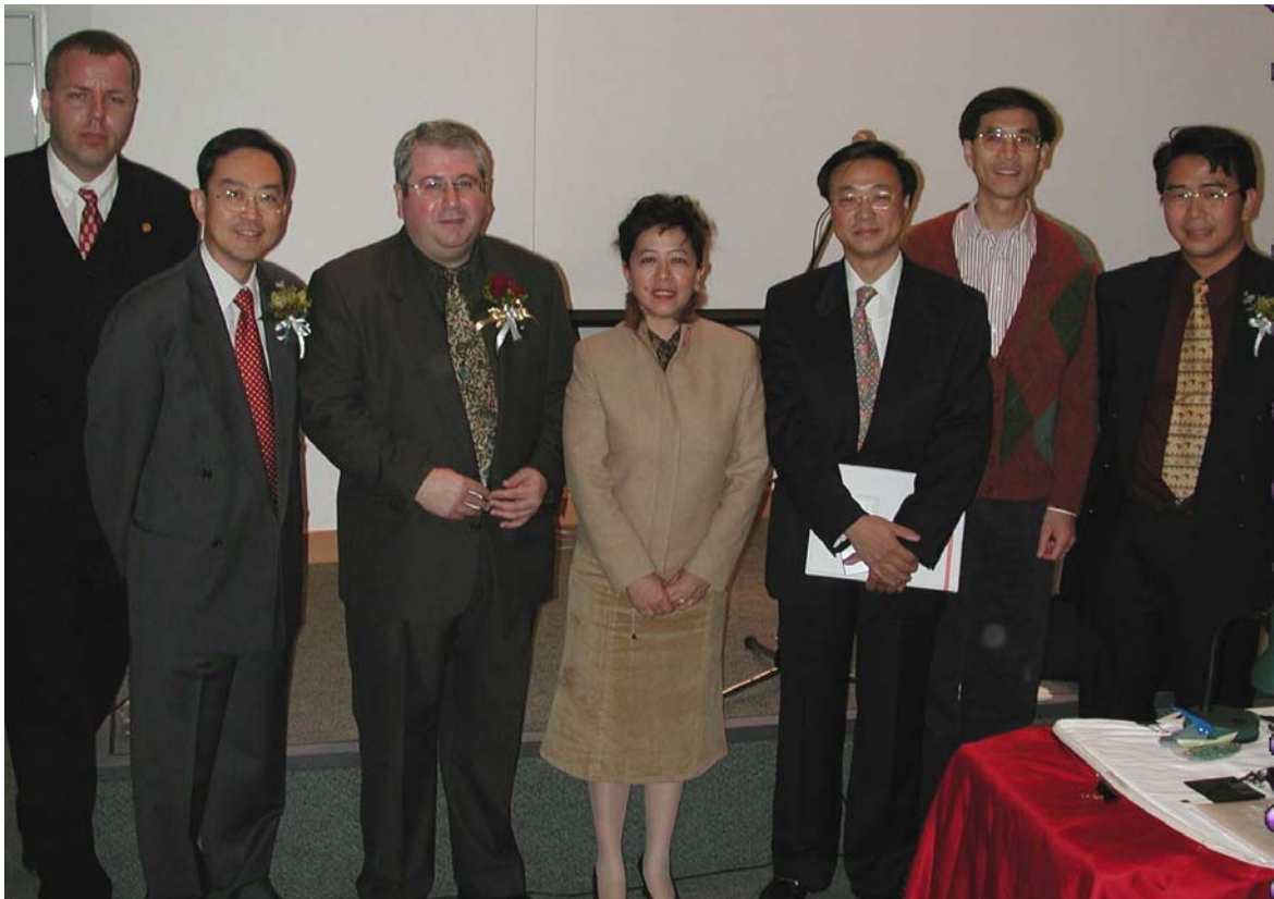
Organizers and speakers

The seminar was sponsored by AGFA Hong Kong Ltd.