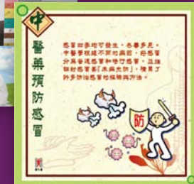
警 預 防 感 冒