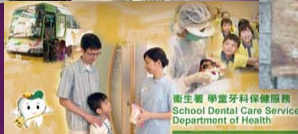
衛生局 學童牙科保健服務 School Dental Care Service Department of Health